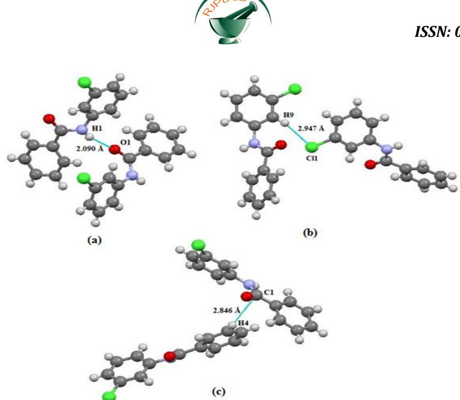
Figure 2: Molecular pairs (a-c in Table 3) extracted using Pixel that stabilizes the crystal packing of Polymorph 1.

The maximum stabilization to the crystal structure comes from N-H...O strong hydrogen bond involving H1, O1 and N1 atoms. The stabilization energy of the pair is -47.4 kcal mol<sup>-1</sup> (Figure 2a) obtained using PIXEL. The main contribution is due to the columbic interaction. One more stabilized molecular pair shows the presence of strong hydrogen bonding C-H...Cl (Fig. 2b) involves C10, Cl1 and H9 atoms. The donor acceptor distance is 2.947Å. It provides the stabilization of 15.2 kcal mol<sup>-1</sup>. Columbic interaction is the main contributor to the stabilization energy for this pair. Motif 3 (Fig. 2c) shows the presence of C–H... \pi (involving H4 and C1 of Centre of gravity [Cg1] of ring1) and provides stabilization of -14.0 kcal mol<sup>-1</sup>.